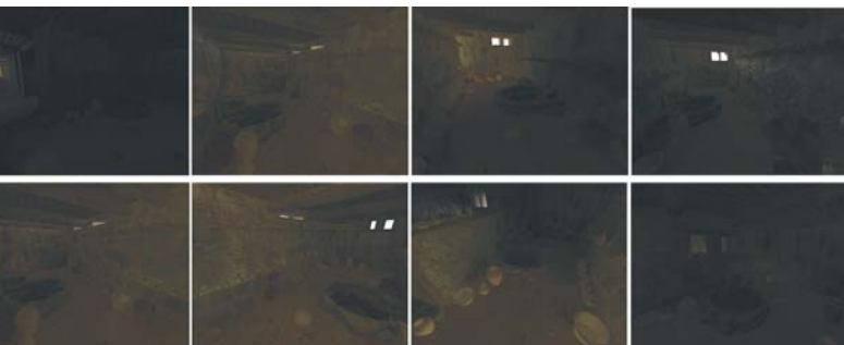
Figure 4 - Alternative structural models of the 'ceramics workshop'. From top left clockwise: no windows, window at the north side, window at the east side, window at the west side, window at the partition wall, lower partition wall, one window at each side, two windows at the north side.

Digital or virtual heritage museums, and in general new technologies, have received widespread averse publicity, and