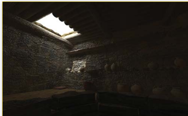
Figure 5 - Virtual construction of an opening at the roof of the 'ceramics workshop'.

However, none of them seem to have facilitated the diffusion of light to a sufficient extent to consider these alternatives a solution to the problematic aspects of the dataset. Also, flame illumination was tested (fig. 7), although this was discouraged from the very beginning, since modern potters argued