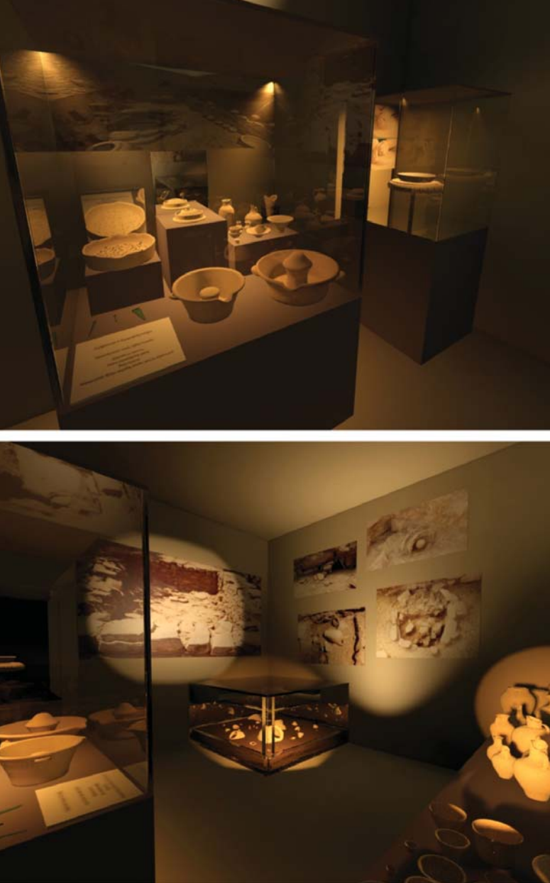
Figure 8 - General views of the 'ceramics workshop' Digital Museum.

are not accessible to the public, apart from a few pictures available at Zominthos Interactive Dig, and the excavation's official website ( www.zominthos.org ), we decided to produce still images and panoramas for the public, also adding images from the excavation of the workshop, thus integrating to some extent the finds with their context.