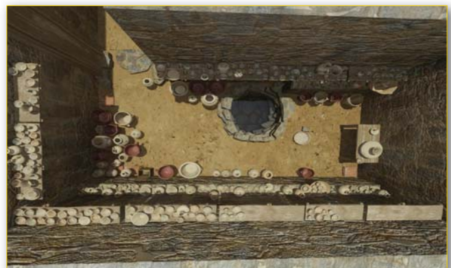
Figure 3 - Virtual construction of the 'ceramics workshop'. Aerial view.