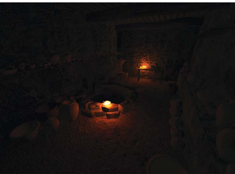
Figure 7 - Virtual construction of the 'ceramics workshop' under flame light. Left: lamp burning wax, Right: Three lamps burning wax and olive oil.

The digital museum of the ceramics workshop was constructed in the summer of 2010, in an attempt to work on different display combinations for the museum that will be erected at some point in the future (fig. 8). By using simple 3d modelling software, we built a one room preliminary model for the finds unearthed in the 'ceramics workshop'. However, as the finds