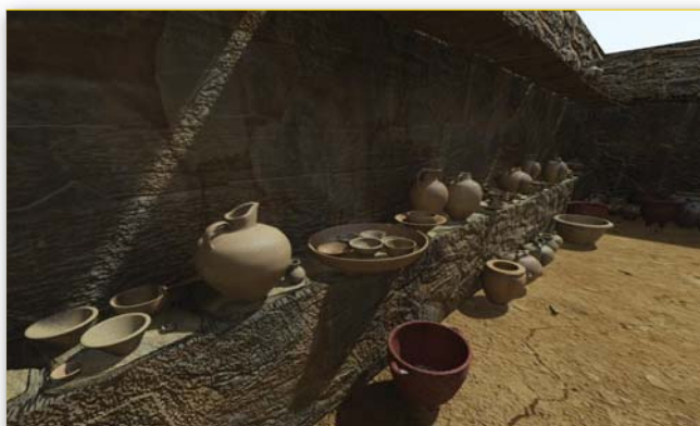
Figure 2 - Close-up view of pottery positioned on a bench, along the north wall of the 'ceramics workshop'.

According to the evidence, ceramics were placed on two benches running along the northern and southern walls (fig. 2), and on wooden shelves along the walls. It is usually complicated to identify ceramics workshops, as they are not architecturally unique, and the artefacts unearthed could be part of a household or of another unit of the settlement. However, in this case all the objects unearthed, strongly suggest that Room 13 was a ceramics workshop. Although Room 13 has provided a range of features, there are two peculiar characteristics: i) Even though the walls are preserved to a significant height, no window was revealed, as it is the case in the adjacent Rooms 14 and 15 as well in Rooms 8 and 9 at the façade of the building. Thus, an illumination study was defined to reveal the extent to which an apparently weakly lit space could be used as a working area, ii) the existence of a basin in the interior is an extraordinary find. In this pa-