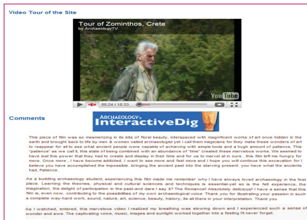
Figure 9 - Video tour of the site in the 'Interactive Digs' of Archaeology Magazine, US.

tion passes to another level, as various hypotheses and convoluted research questions can be effectively tested through experimental opportunities that are not given by conventional means of recording.