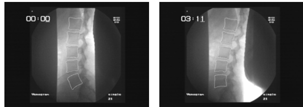
Fig.1. Automatic extraction of lumbar vertebrae in DVF images.

on an articulating table [7]. The outlines of the vertebral bodies can be clearly seen overlaid with the models defined from the edge data shown in figure 2.