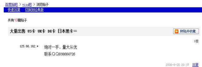
Figure 3: a typical carding related advert on Baidu Tieba

A typical sale advert is as shown in figure 3. The typical format of an advert on Baidu Tieba consists of a short message containing a brief description of the goods and services for sale or request (such as the country and types of credit cards) as well as leaving the QQ number for interested buyers to hold further negotiations in private conversations via QQ (see next section for a more detailed examination of QQ IM). This advertisement says that the seller has large quantities of credit card data from the US, UK, DE (Germany) and Japan.