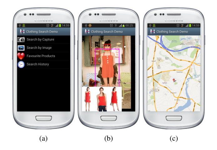
Fig. 2: Application: (a) home, (b) search, (c) product map

Several clothing datasets exist but none of them are suitable to evaluate our clothing retrieval task. Datasets mentioned in the current literature either do not solely contain frontal poses [8], or do not feature a large range of clothing and people, or do not feature adults [2], or are low resolution [5] or private. We collect two datasets: a query dataset (DQ) and a product dataset (DP). We primarily consider woman's clothing since it generally exhibits a greater range of colours, textures and shapes than men's and can also be more complex for retrieval than men's due to clothing occlusions by long hair. Dataset DQ consists of a subset of 1000 images from the Fashionista dataset [8] featuring frontal poses suitable for our Viola-Jones face detector.