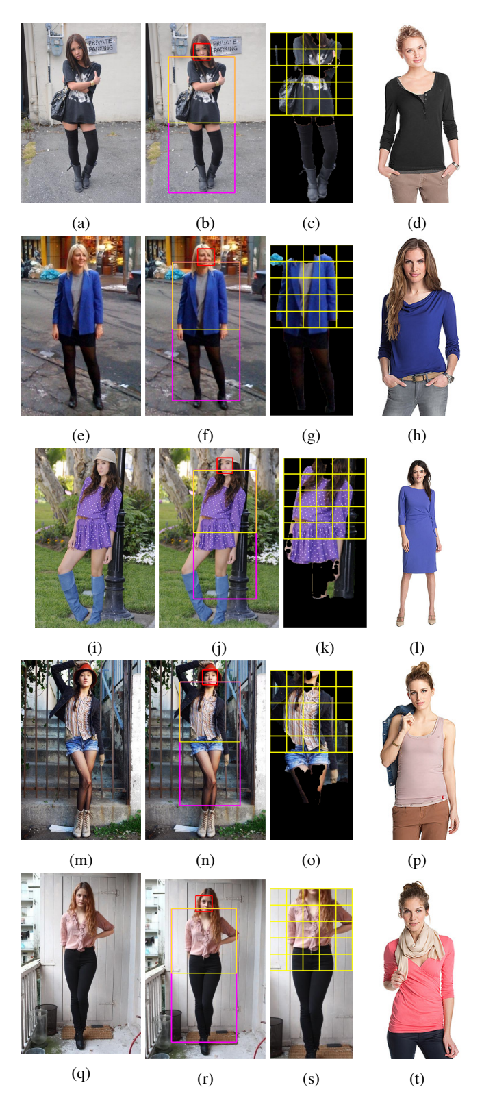
Fig. 3 : Qualitative results. Columns depict: (1) query image (I_q) , (2) ROI<sub>p</sub> (magenta box) and ROI<sub>u</sub> (yellow box), (3) segmented clothing (I_c) overlaid with feature extraction grid, and (4) top retrieval candidate (\hat{j}) .