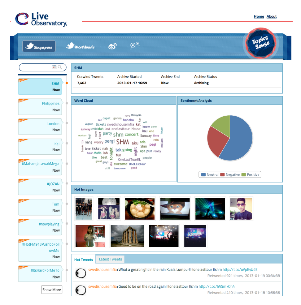
Figure 2. The National University of Singapore and Tsinghua University's NExT-Live Observatory. The Observatory provides online analysis and visualization of social, business, government, and research activity.

resources of the 15 University Labs affiliated with the Web Science Trust (WSTNet; 992 http://webscience.org/wstnet-laboratories/wstnethome from Brazil, China, South Korea, Europe, and the US. Current work includes the deployment of harvesters to collect data on the use of Web resources. schemas to describe datasets. deployment of data repositories based on existing platforms such as EPrints, and gualitative and quantitative methods to establish trends and