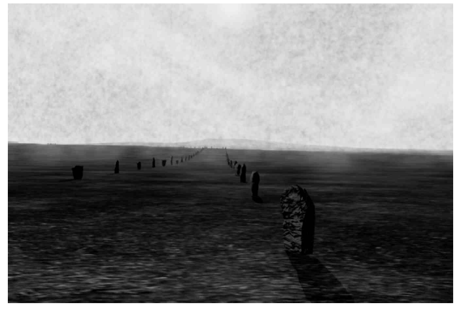
Fig. 2 – A three-dimensional reconstruction of the Beckhampton Avenue, looking down the Avenue from the western entrance to the Avebury henge.