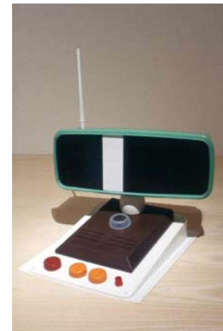
Top left: Brian Griffiths, Portable Computer B , 2001 Top right: Nicole Wermers, Untitled , courtesy Herald Street London, 2005 Bottom: Anya Gallaccio from That Open Space Within (installation view), 2008