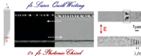
Fig. 1 (centre) Bright field images (light part) and images in crossed polarizers (dark part) of the lines written in opposite directions with amplified Yb fiber laser at 500 kHz repetition rate, writing speed 250 \mu\text{m/s} and pulse energy 0.9 \mu\text{J} . (left) The tilted front of the pulse along writing direction is shown. (right) SEM images of cross sections of lines written with polarization perpendicular to writing direction are also shown. The nanograting of about 300 nm period, which is responsible for the form birefringence of irradiated regions, can be seen only in the initial part of cross sections of lines written in one of two directions. The region of collateral damage is marked with dashed line.

Recently, a remarkable phenomenon in ultrafast laser processing of transparent materials has been reported manifesting itself as a change in material modification by reversing the writing direction