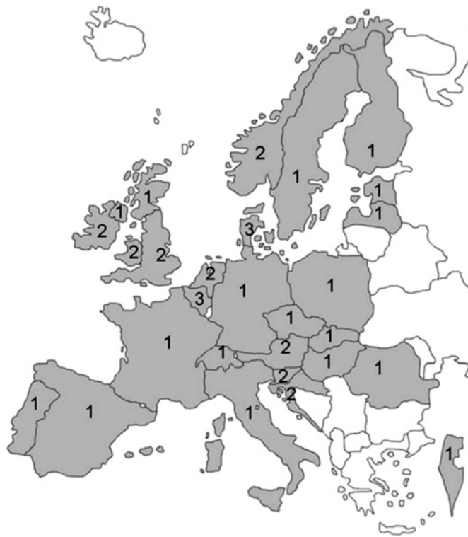
Figure 2 Map of Europe (+Israel): the number in each country represents the number of experts participating in the expert panel.

These results are remarkable, since they were already achieved after the first of two rounds of scoring. And what is more, the expert panel consisted of experts from 24 different countries all over Europe and Israel (figure 2).