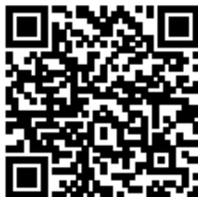
Figure 2 QR Code

The profusion of smart-phone technology worldwide has led to the potential expansion of technologies such as QR (Quick Response) codes (Figure 2) into a more diverse range of applications. QR codes were initially created in the early 90s by Denso-Wave a subsidiary of Toyota. They represent an evolution of barcoding, containing data both vertically and horizontally, a property which enables them to hold considerably greater volumes of information in comparison to a bar code (Denso-Wave 2010). The main proposition behind QR Codes is to replace barcodes as a line-of-sight method of identification. A growing wave of smart-phone applications are able to read these codes which can link the user directly to an internet-based resource, free text, vCard or even a pre-filled SMS or email message (AcadntIPoet 2010).