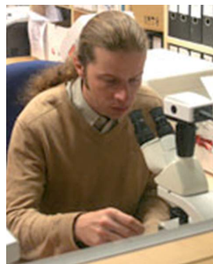
Simon J Coles

† Electronic supplementary information (ESI) available: Datasets and experimental protocols are provided for data collected on the Diamond I19 beamline, the VHF and UHF rotating anode diffractometers and a sealed tube source (image plate) diffractometer are provided. These a) serve as exemplars for data collected at the NCS and b) form the basis for a comparison of the power and capability of the different instruments. CCDC reference numbers 855293–855295. For ESI and crystallographic data in CIF or other electronic format see DOI: 10.1039/c2sc00955b