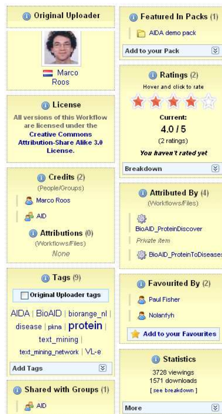
Figure 1. Contribution metadata.

Through its design to support Research Objects, myExperiment recognises that researchers work not just with individual items but with collections of items associated with a particular study. These may be stored locally, in multiple repositories or as native Web content. Hence research objects in myExperiment can be aggregations of items stored in the myExperiment repository as well as elsewhere. In myExperiment these are called “packs”, and while a pack might aggregate external content stored in multiple specialised repositories for particular content types, the pack itself is a single entity which can be tagged, reviewed, published, shared etc. For example, a pack might correspond to an experiment, containing input and output data, the experiment plan, associated publications and presentations, enabling that experiment to be shared; another example is a pack containing all the evidence corresponding to a particular decision as part of the record of the research process. Packs are described using the OAI’s Object Reuse and Exchange representation.