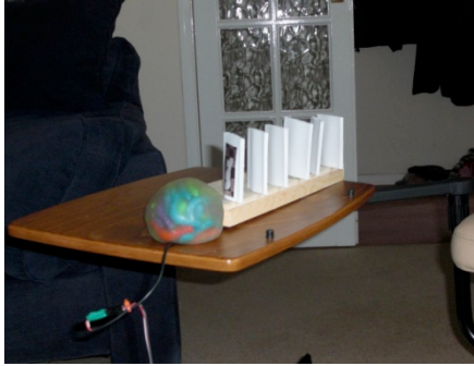
Figure 1: Tangible chess board

could develop a technology so that he could play chess and exercise his hand and arm at the same time.