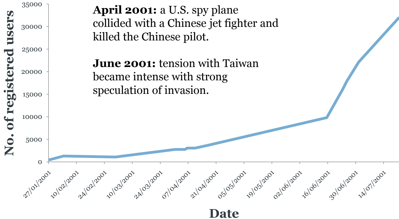
Membership growth pattern of the Honker Union of China hacktivist group in 2001