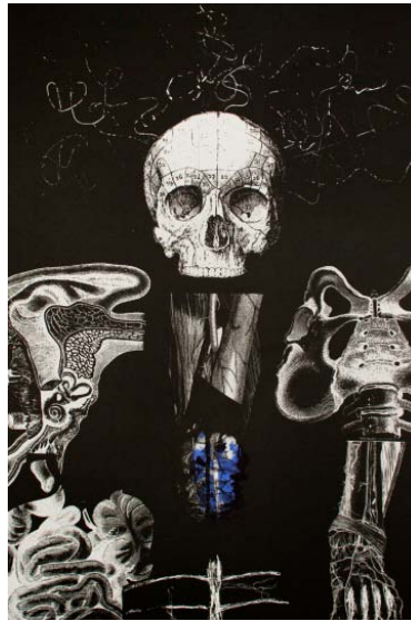
Susan Aldworth, Reassembling the Self , Lithograph, 84 x 55 cm, 2012

GV Art Gallery, 49 Chiltern Street, Marylebone, London W1U 6LY