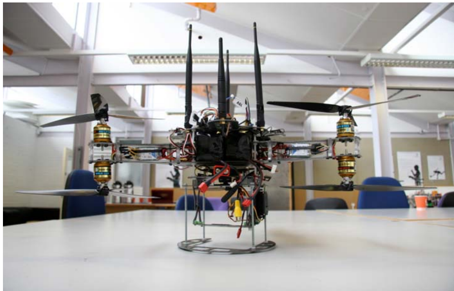
Fig. 2. The Middlesex University Co-Axial Tri-Rotor Unmanned Aerial Vehicle.

The gross dimensions of this UAV are Ø0.7 m (tip to tip) x 0.3 m. The system is capable of hover and perch (it can land and still rotate its camera sensors).