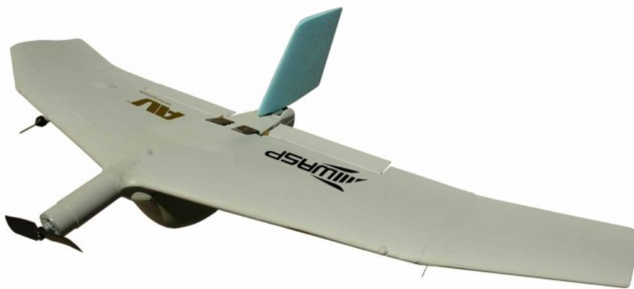
Fig. 1. The WASP III Unmanned Aerial Vehicle (AeroVironment Inc., USA).

The most common type of UAV remains the Fixed Wing system (71%), followed by Rotary Wing (18%), Shrouded Rotary Wing (Ducted Fan) (3%), Lighter-than-Air (3%), and then a series of other systems which include motorized parafoils, tilt rotors, flapping wings, etc. AeroVironment Inc, in the US, is at the forefront of this technology with their Wasp III fixed wing UAV system (See Fig 1 below).