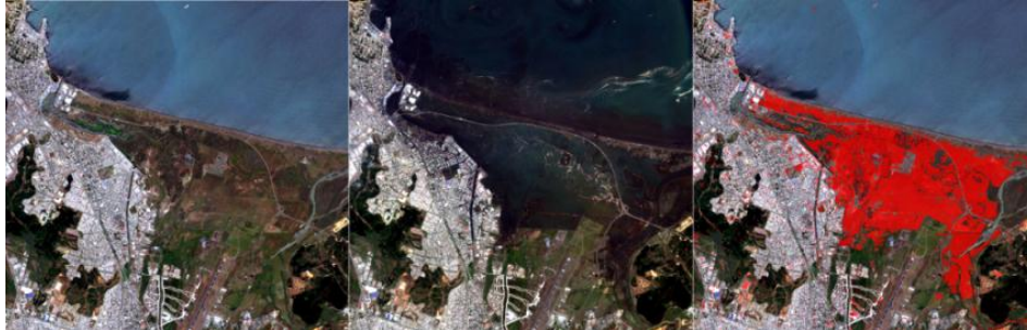
Figure 1. Damage by tsunami: City of Concepcion, Chile imaged on 10/01/2010 (left images) and 27/02/2010 (centre/right images) by the RapidEye satellite constellation. The centre image was taken eight hours after an earthquake of magnitude 8.8 had occurred and the resulting tsunami had affected the shoreline. The right map shows the areas with tsunami-related changes (red layer) on the post-tsunami image.

task requirements and appropriate decision support. Multiple NTWCs will jointly share observations from multiple sensor networks in the NEAM region as well as information bulletins about imminent tsunamigenic events. The timely and reliable dissemination of bulletins and warning messages issued by governmental agencies has legal implications, adding to the challenge when setting up and testing communication channels. During a natural crisis situation, responsible agencies might also elect to forward situation information to other organisations such as Search and Rescue (SAR) or the remote sensing industry.