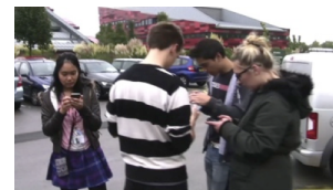
Figure 3. Players from left to right: LT, SS, CR, PC. LT walking around the team, her body orientation suggesting attempts to leave the group.

[0:00] After a target drop off, LT and SS joined PC and CR at drop off zone. [0:24] HQ sent message A : LT, if you think you have the stamina to run to 10 around the north of the lake do so now with a firefighter [0:28] Agent instruction received: NK, LT -> 16 LT: They said ((reads out aloud HQ message A)) [0:35] CR ((facing LT)): Shall we go get 10 LT: Mine is 16 [0:38] HQ sent message B : Avoid 17 at all costs (...) I'd avoid 10, too. CR: ((read out HQ message B)) avoid 10 now. [0:55] New agent instruction received: NW, LT -> 15 LT: 15! [Fig. 3] LT keeps walking and turning back and forth from others. PC and SS discuss next steps, LT does not engage in the discussion with them. [1:12] SS ((facing PC)): Shall we go get 19? ((turning towards LC and CR)) are you going to 10 or something? CR: Eh::, HQ said no. [referring to message B] [1:24] SS and PC decide to go for target 19, and leave. [1:29] NW sent message: LT where you CR ((facing LC)): Are you LT? LT: Yes. CR: NW is looking for you. LT: Yah thanks. ((turning away from CR)) Ah::, I will go towards them. ((starts walking)) CR: Okay. Do you want company? LT: ((turning back towards CR)) Yeah. CR and LT leave drop off zone together to find NW.