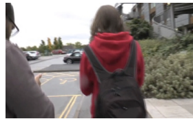
Figure 4. AW (right) leads the way, heading to target 44 as instructed.

[00:00] HB, AW at drop-off zone, new instruction received: AW, HB->44 HB: Alright, who is AW? AW: Me. HB: let's go southeast (the direction of target 44). [00:07] AW, HB looking at their screens [00:26] HB: There is no 44. AW: down there HB: Ok, yea, yea, yea (0.5), I can't see, Oh, there, yea, let's go [00:35] [Fig. 4] Team begins moving towards 44 [00:48] HQ sent message: Target 42 and 44 is not reachable. AW: ((reads out the message)) AW and HB stopped walking. [00:52] New instructions received: AW, KD -> 44, HB, AR->31 AW: I got a new instruction. [Fig. 5] AW and HB simultaneously turn and start walking back towards the drop off zone HB: I need to team up with AR AW: I need to team up with KD! Oh, it is 44 again. [01:01] AW, HB arrived at drop off zone, met AR, KD HB: AR? KD: AW? We have got (1.0), 44, right? AW: It said 44 is not reachable, but I got it again, so, let's try. KD: Alright [01:14] AW, KD begin walking to 44, AR, HB team up as well.