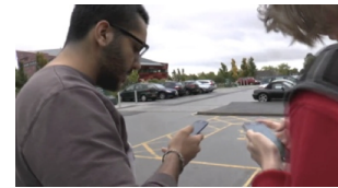
Figure 5. After the team received an instruction to disband, AW (right) and HB (left) simultaneously turn back and start walking back to the drop off zone, displaying bodily alignment.

This episode begins with an instruction ( AW, HB -> 44 ) from the agent. At that moment, there were 5 players at the drop off zone (AR, KD, LC, HB, AW). Immediately after the instruction, HB starts looking for AW in the local group. Shortly after, AR and HB team up to go for 44 as instructed. However, 13 seconds later the team is interrupted with a HQ message telling them not to go for 44 ( Target 42 and 44 is not reachable ). Four seconds later, a conflicting agent instruction was delivered, implying they disband the team ( AW, KD -> 44, HB, AR->31 ) but still pursue the target 44. At first, AW stops walking and topicalises the instruction ( AW: I got a new instruction ), followed by both teammates simultaneously turning towards each other (Fig. 5). The bodily alignment in the action suggests agreement to follow the new instruction. On their way back to drop off zone, HB and AW confirm their intentions (HB: I need to team up with AR , AW: I need to team up with KD! ). In this case, the teammates respond to the interruption by mutually agreeing to abandon the current team and task in favour of following the new assignment.