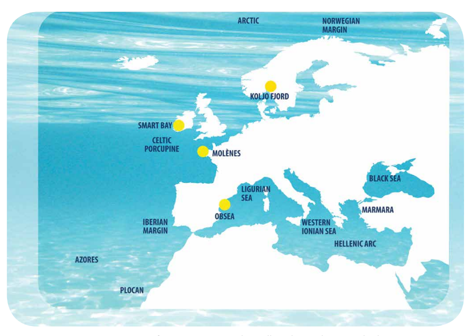
Figure 1. Map of current EMSO nodes. Yellow dots indicate testbeds.

Turkey, Germany, and the Netherlands. Participation is open to all (both individual scientists and institutions), and will be coordinated through an association called ESONET-Vi (European Seafloor Observatory NETwork—The Vision), following the extensive scientific community planning