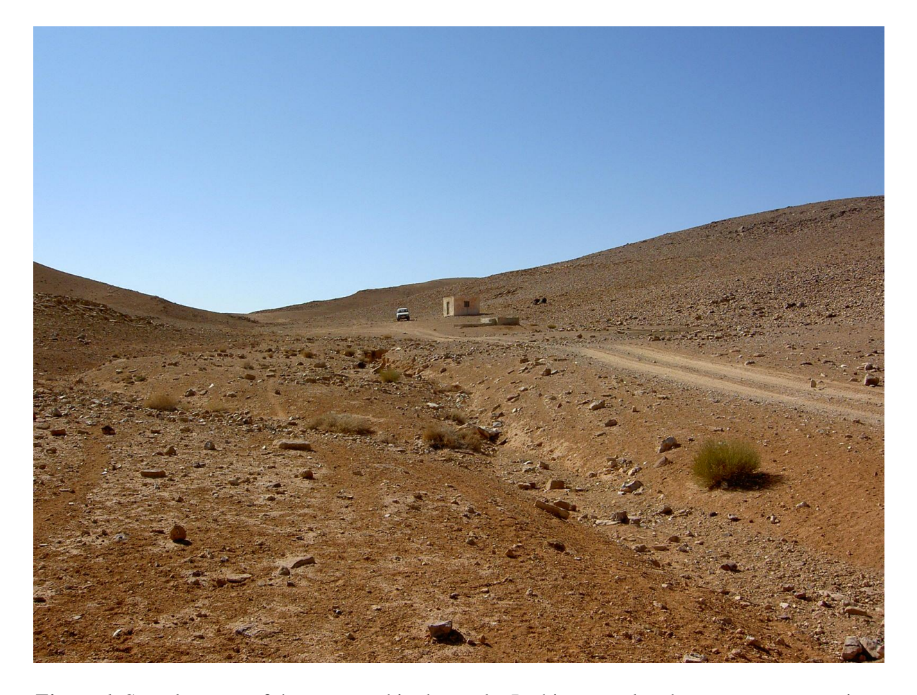
Figure 1. Sample scene of the type used in the study. In this example, observers must examine the ground for signs of disturbance, and check the building and surrounding hillside for locations where an opposing force might choose to launch an attack. Note that this image does not contain any threats/risks.

There exists an extensive body of prior research that has examined the role that experience and expertise plays upon visual cognitive processes (Reingold & Sheridan, 2011). Typically these studies have found that increasing experience with a given task improves performance substantially. The key issue that arises from this shift in performance is how experience improves performance: is it through improving information-sampling (i.e., the objects