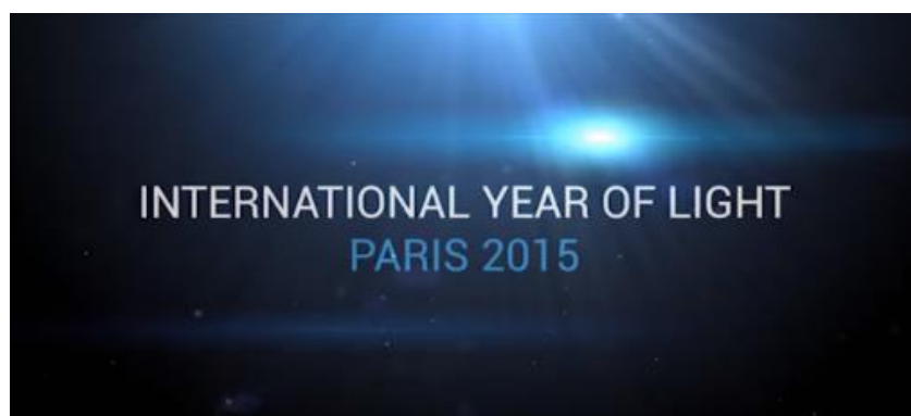
Video 2. A label of “Year of Light”, a video report from members of the IYL 2015 UoS student-led delegation about their experiences of the IYL 2015 opening ceremony. https://www.youtube.com/watch?v=sDMA4pWdYc4 .

The project was documented in a variety of formats, including personal blogs 12 , press 13,14 , school newsletters 15 , and institutional news articles 16 . With the assistance of the UoS Institute for Learning Innovation and Development 17 , the students produced a video report to relate their experiences of the IYL 2015 opening ceremony; see Video 2.