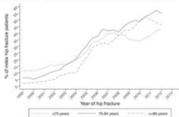
(b): anti-OP initiation within 1-year from index hip fracture: stratified by age