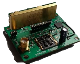
Figure 2. Prototype satellite sensor.

The realised prototype wirelessly powered sensor node is shown in Figure 2, the patch antenna is not shown but connects to the SMA connector on the board and provides both harvesting and communication functionality.