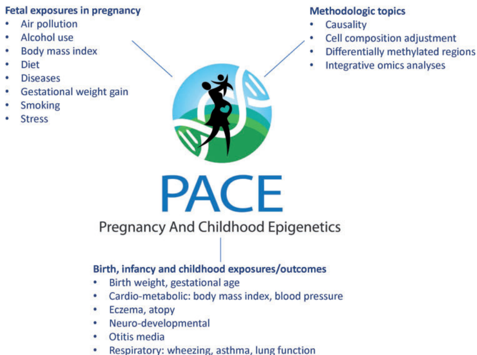
Figure 3. Current main exposures, outcomes and methodological topics in the PACE Consortium.

metabolomics if available, creating the possibility for integrative omics analyses. The availability of GWAS data enables analyses of associations of genetic variants with DNA methylation, as well as analyses to assess the potential influence of genetic variation on methylation variance, the possible causal role of DNA methylation differences using a two-step mendelian randomization approach, and adjustment for genetic markers of ancestry. 36–38