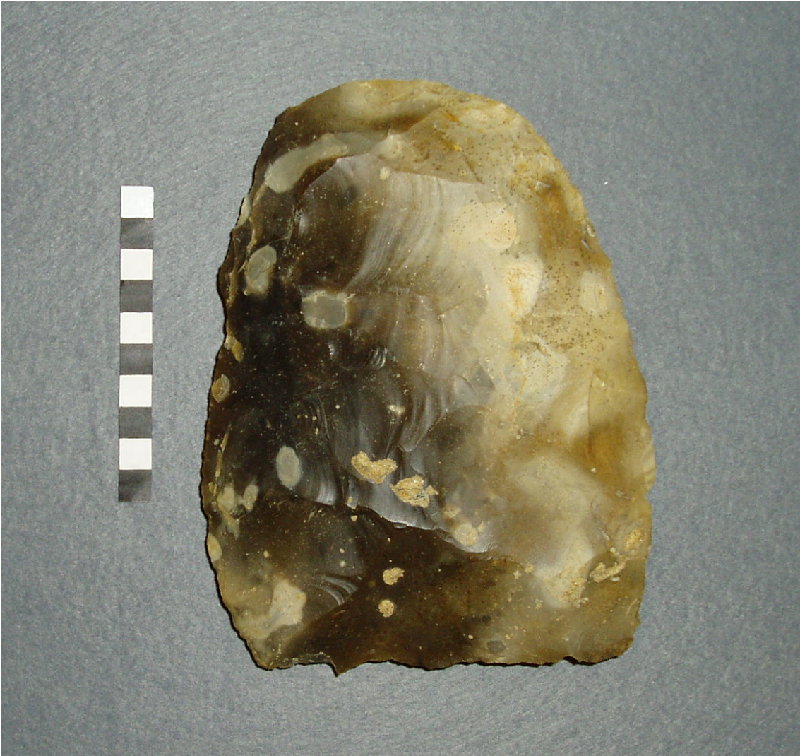
Figure 5. The cleaver [scale cm]

The second big surprise of the sondage was the shallow depth at which Chalk bedrock was reached, not much more than one metre down at 16.2 m OD. Consequently access to the trench was unproblematic, and the sections could easily be cleaned by hand. In the course of cleaning numerous artefacts (including two further pointed ficron handaxes) were identified in situ in the section at the same level as the giant ficron just found. A sharp-edged flake was also found, well-embedded in the section (Figure 4), and removal of this was left until the section had been recorded and OSL sampling completed. Upon excavation it quickly transpired that we were dealing not with a flake, but another giant handaxe, this time a cleaver 179mm long by 134mm wide at its widest point and with a transverse cutting blade 110mm wide (Figure 5). Both faces of the cleaver edge are tranchet-sharpened, with each face having one main tranchet blow. Both blows were struck from the right (if the handaxe was held for knapping them in the palm of the hand with the tip facing inward, as seems most likely to this knapper).