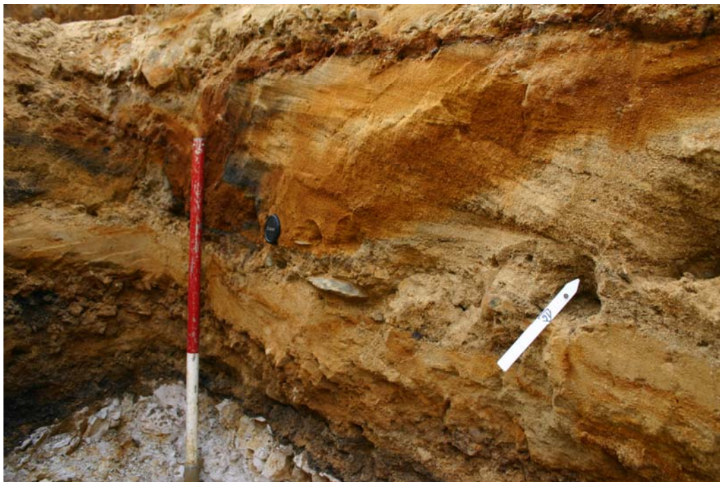
Figure 4. Sondage section, level 2b and cleaver in situ