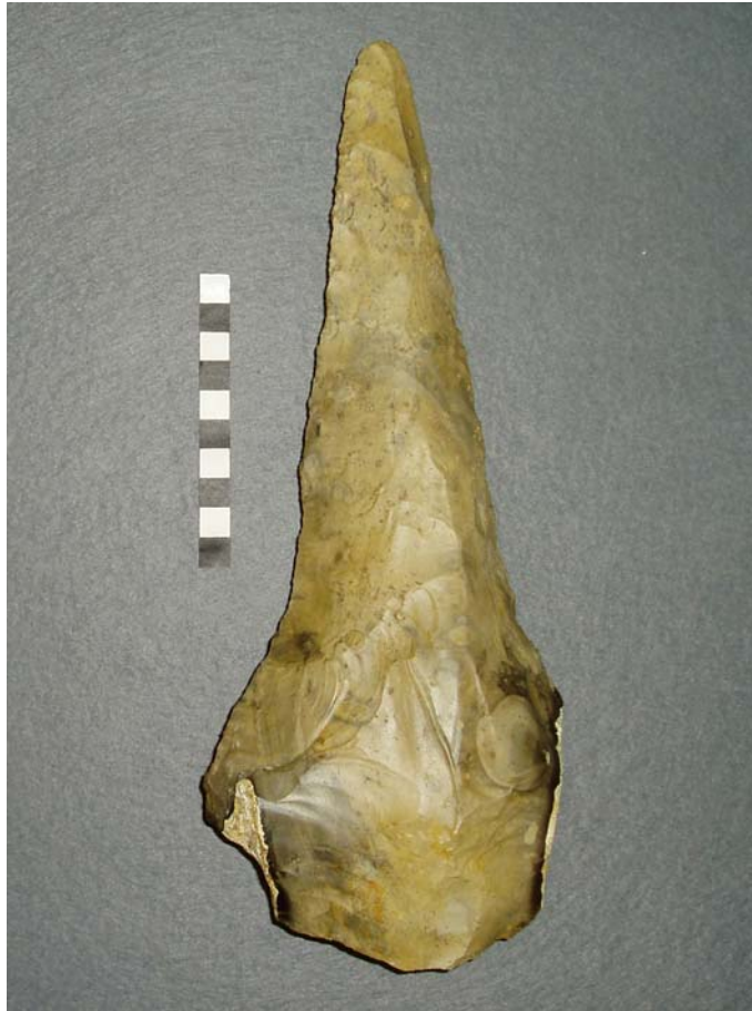
Figure 3. The ficron [scale cm]