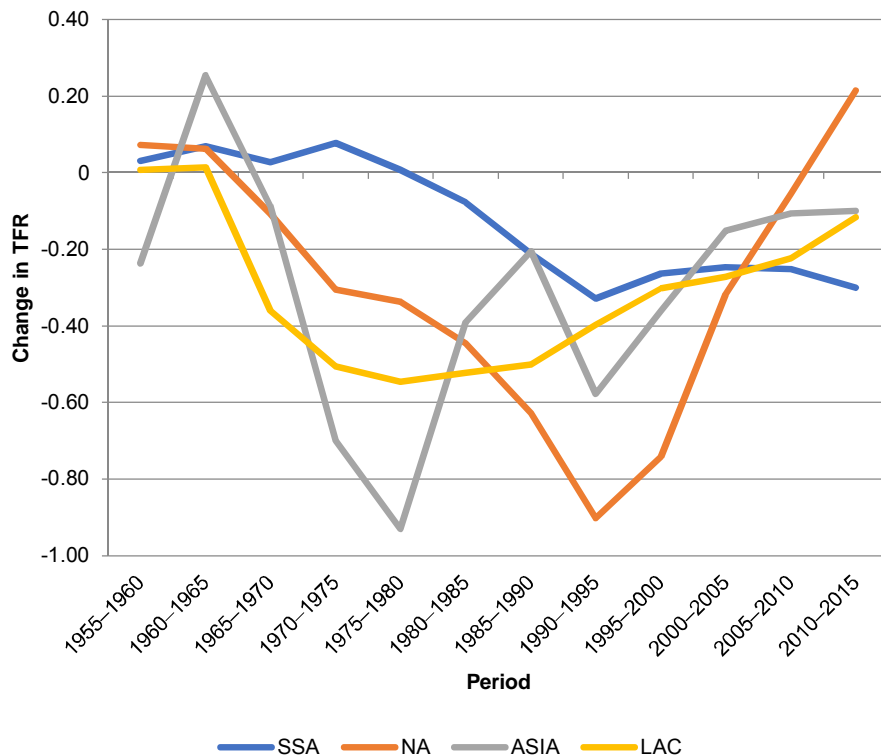
Figure 1: Quinquennial changes in total fertility rates, 1955–2015

For the 25-year period after 1985–1990, sub-Saharan Africa had a pace of fertility decline that was initially slower than the declines in other regions, but during the past 10 years, as the pace of fertility decline has diminished in Asia and Latin America and decline has reversed in North Africa, sub-Saharan Africa has become the region with the most rapid pace of fertility decline.