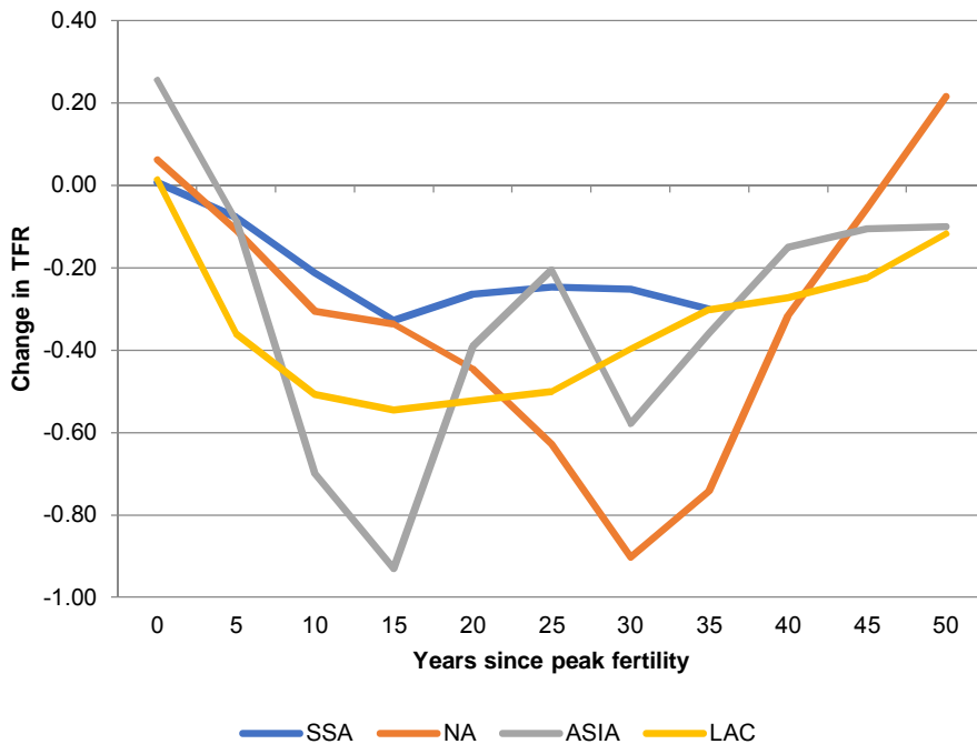
Figure 3: Quinquennial changes in TFR, by region and years since peak fertility

Consider now the cumulative effects of the quinquennial fertility changes that have taken place since the onset of fertility transition. Based on Figure 2, we observe only the first 15 years for sub-Saharan Africa. From years 0–15 following the onset of fertility decline the TFR in sub-Saharan Africa declined by 0.80. This was essentially half of the corresponding declines in Asia and Latin America, and even less of the decline in Northern Africa. In Figure 3 the period of observation for sub-Saharan Africa has more than doubled, to 35 years. During those 35 years the TFR in sub-Saharan Africa declined from 6.78 to 5.10, by 1.68 children. This represents a decline of about 25% from peak fertility. In each of the other three regions the TFR fell from 3.1 to 3.5 children during the first 35 years of fertility transition, representing declines of 50% to 56% of peak fertility.