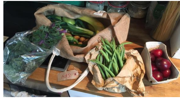
Figure 1 – A large family size veg box.

Entry Interviews. Participants in the subscribed group were asked questions about their motivations for subscribing, how the veg box affects their food practices and also other opinions related to the service. Participants in the non-