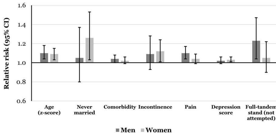
Fig. 1 Mutually-adjusted relative risks for incident falls between Waves 4 and 6 among 1515 men and 1783 women aged 60 and over. Relative risks are per unit increase in age, number of comorbidities and depression score (CES-D); compared to those without incontinence; per higher category of pain; compared to those who were married/cohabiting; and compared to those who were able to hold a full-tandem stand for the required time. Relative risks were additionally-adjusted for: previous falls, hearing, vision, frailty status, forced expiratory volume and cognition. Among men, additional adjustments were household wealth, smoking status, physical activity and alcohol consumption frequency; among women, relative risks were additionally adjusted for BMI

over a 4-year period. Of the 17 characteristics examined, only older age was associated with increased risk of falls in both men and women in multivariable-adjusted analyses. Some risk factors were predictive of incident falls in one sex but not in the other. Increased comorbidity ( p = 0.052 ), higher levels of pain and poorer balance were associated with a raised risk of falls in men, and being more depressed, incontinence and never having been married were associated with a raised risk in women.