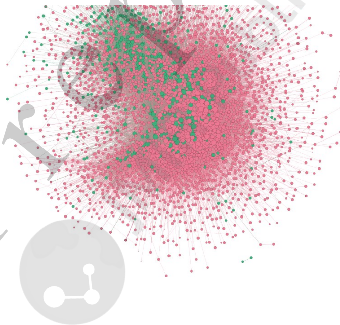
Figure 1. The who-follows-whom network among ED users on Twitter, laid out by the Fruchterman-Reingold algorithm [77]. Node colors represent dropout statuses, where the red color denotes dropout and the green color denotes non-dropout. Node size is proportional to the in-coreness centrality.

254 We obtain 2,906 users who posted more than 10 tweets (excluding re-tweets) and 50 words in our data, where 2,459 255 (85%) users had no posting activities during our two observation periods. Among 357 users who self-reported gender 256 information in their Twitter profile descriptions, 84% of them ( n = 300 ) are female. The mean age is 17.3 among ED 257 users who self-reported age ( n = 1,015 ). Based on the timestamps of account creation and last posting, we use the 258 Kaplan-Meier estimator to estimate the "lifetime" of a user on Twitter, i.e., the duration from account creation to the last 259 posting. The estimated median lifetime of these users on Twitter is 6 months, i.e., one half of the entire cohort drops out 260 at 6 months after creating an account. Figure 1 visualizes the social network between dropouts and non-dropouts among 261 ED users. We note that users with the same dropout states tend to cluster together. Computing Newman's homophily 262 coefficient r [76] of this network by users' dropout states, we find r = 0.09 ( z = 16.84 and P < .001 compared to a 263 null model, see SI ), suggesting that users with the same dropout states tend to befriend one another. See SI for details of data statistics.