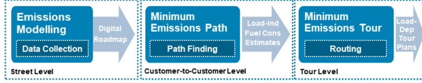
Figure 2: Tasks and flow of information in green urban transportation, adapted from [59]

data as well as the particular optimization tasks required to optimize green urban transportation services.