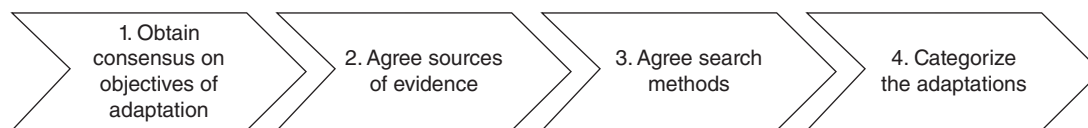
FIGURE 1 Proposed “stocktaking” approach to documenting observed adaptation

Reduction of present vulnerabilities is the foundation of adaptation as it focuses on reducing poverty by addressing structural issues which, evidence shows, inhibit adaptation action (Duncan, Tompkins, Dash, & Tripathy, 2017). Despite this empirical evidence, it appears that much adaptation action is having little impact on vulnerability (Atteridge & Remling, 2018). Vulnerability reducing actions may look very different according to the social, political, hazard, or environmental