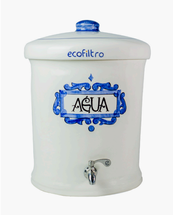
Figure 4. Urban Areas Ecofiltro