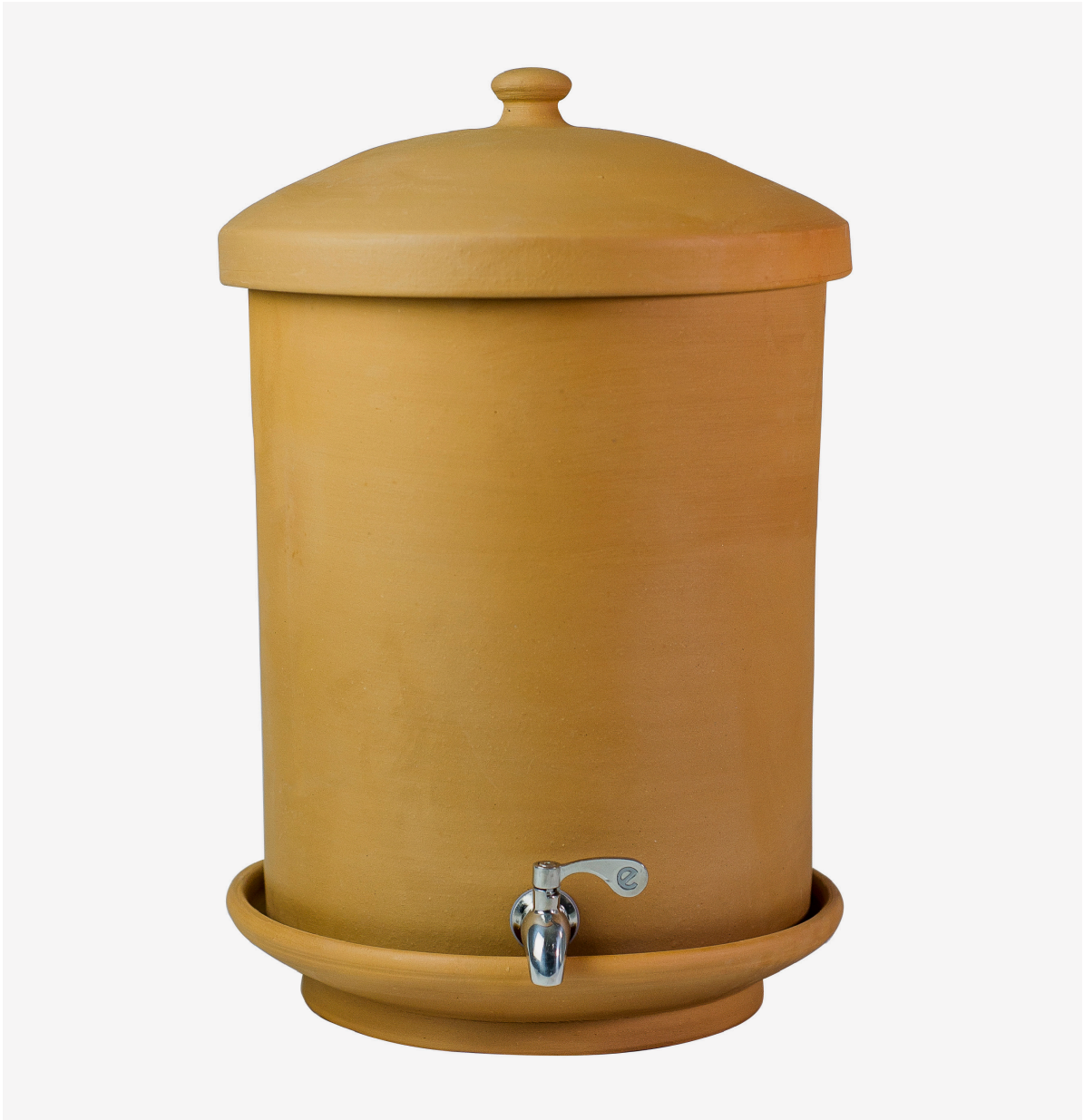
Figure 3. Ecofiltro