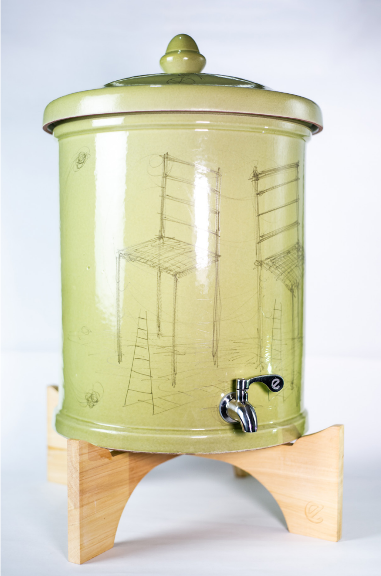
Figure 5. Ecofiltros painted by Guatemalan graffiti artists