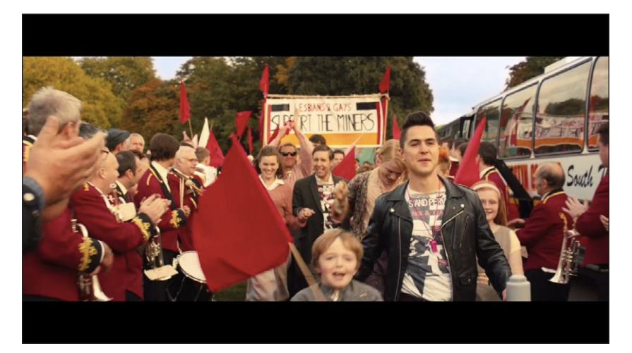
Figure 3: Tradition giving way to change, defeat transforming into victory (screengrab from DVD).

When the film opens the strike has already been ongoing for four months, with Mark watching news of its progress on TV. Its place on the news establishes its public importance as it also suggests our distance from it, and identification instead with the perspective of Mark, and by extension, LGSM. Thus the different temporalities of the film are layered so as to identify the miners with tradition and the past, and LGSM with change, and therefore the present—not solely the present of the film's action but eventually that of the viewer. The film's temporal dynamics stage the supersession of the legacy of socialist culture by a politics based more in