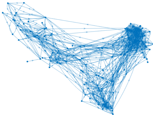
Figure 1: Friendship Nomination Network