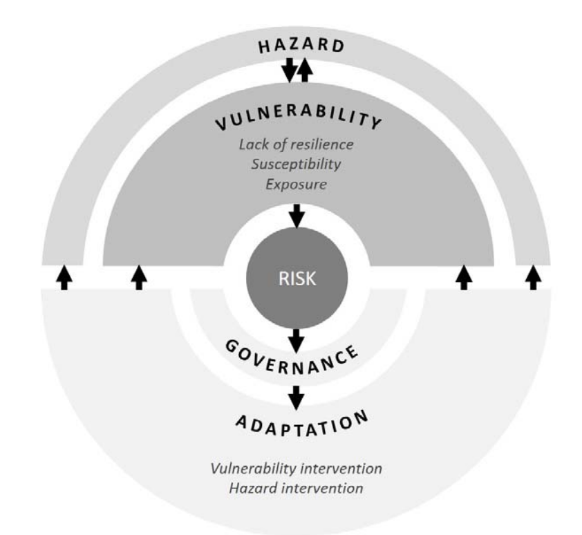
Figure 1. Framing adaptation, risk and vulnerability (adapted from [7]). The figure shows the multiple components of climate change adaptation. Risk results from the interactions between hazard events and vulnerability. Improved governance and adaptive capacity reduce risks.

change in order to make appropriate use of the available technology offered by mobile phone data and lessen the constraints faced by cities to intervene in vulnerability.