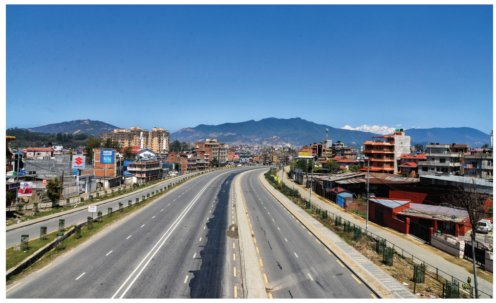
Photo: Empty streets of Kathmandu city due to nationwide complete lockdown, the capital of Nepal (used from the collection of Pramod Bhattarai photo gallery with permission).

The government has limited capacity and expertise to chart any emergency measures to address these pertinent health issues, as the available resources are fully channeled towards combatting COVID-19. Prolonged exposure to malnutrition can weaken the immune system, especially during an epidemic outbreak. In Nepal, the coexistence of the double burden of malnutrition aggravates COVID-19 exposure and can perpetuate the vicious cycle of weakened immunity and infection [12]. Historically, Nepal has been facing food and nutrition security challenges with the highest prevalence of double and triple burden of malnutrition [13]. The prevalence of stunting, underweight, wasting among under-five children, and anemia among women of reproductive age are already among the highest in Nepal when compared to other South Asian countries [7]. The COVID-19 outbreak may exacerbate the extensive losses related to food production and food supply chain, thus putting the migrant and labor population at risk of hunger and malnutrition.