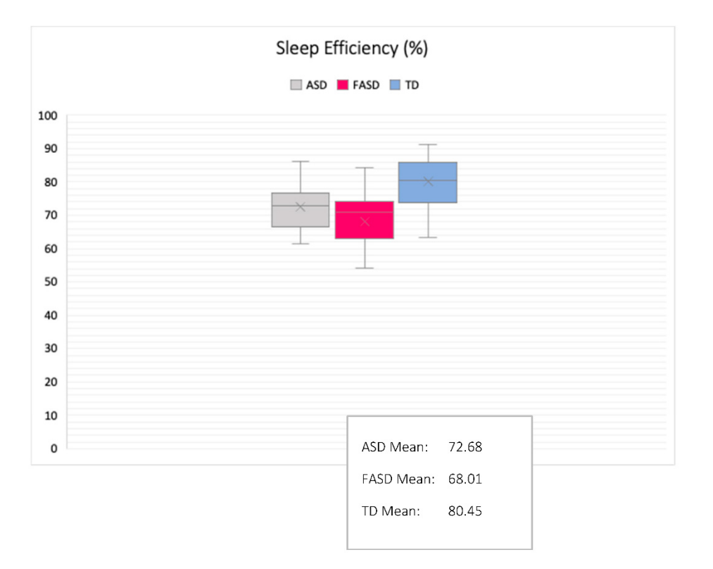
Figure 5. Sleep efficiency as a percentage: comparison between groups (M/SD shown).