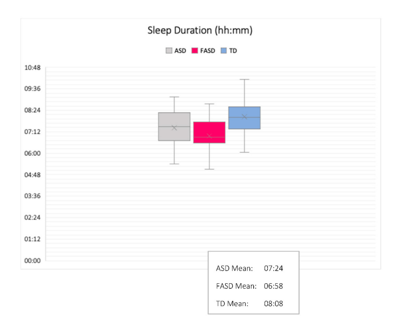
Figure 4. Sleep duration (hh:mm): comparison between groups (M/SD shown).

<sup>1</sup> Significant similarity between autism and FASD ( p \le 0.05 ); <sup>2</sup> Significant difference between autism and TD ( p \le 0.05 ); <sup>3</sup> Significant difference between FASD and TD ( p \le 0.05 ); <sup>4</sup> Significant difference between autism and FASD ( p \le 0.05 ). * Medium effect size. Significant results shown in bold.