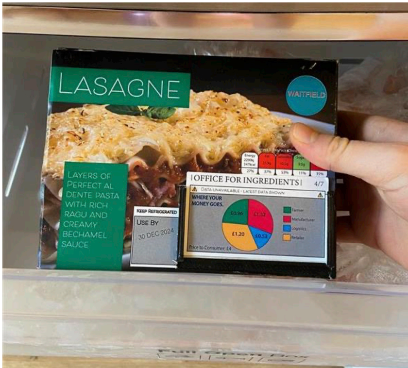
Figure 3. Design fiction object: smart packaging

outside academia in line with the focus on engagement at the heart of responsible innovation.