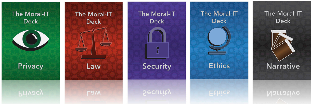
Figure 1. The Moral-IT card categories or “suits”

exercise. Previous work has shown that the Moral-IT cards work flexibly across a range of IT-based technologies to enable developers to ethically consider their work. The flexibility of their use allows for the expression of a range of perspectives, anchored through the shared resources of the cards to facilitate the ethical assessment of technology. 48 Through the use of combining design fiction and these cards, we can explore speculative ethical challenges.