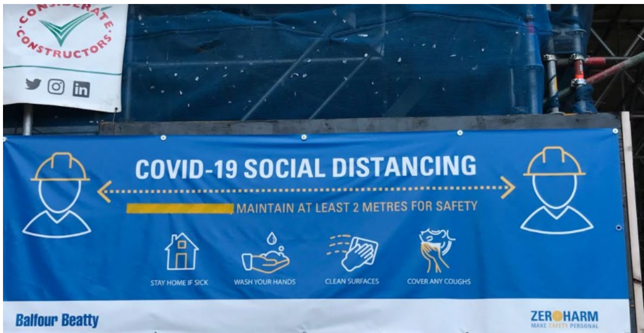
Figure 1. Example of the Social Distancing Sign and Barrier at Construction site.

instructed social distancing sign and the barrier at the construction site for keeping the social distance between workers.