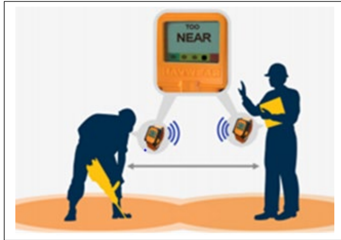
Figure 2. To manage that Social Distancing between workers is maintained.

To study the contacting time between workers in the construction worksite, the contacting time (times of workers within 2m distance) of workers wearing HAVwear at the worksite was measured before and after they were followed HAVwear Social Distancing information from the HAVwear as shown Figure 2. The experiment was performed on 4 different weeks as shown Table 1.