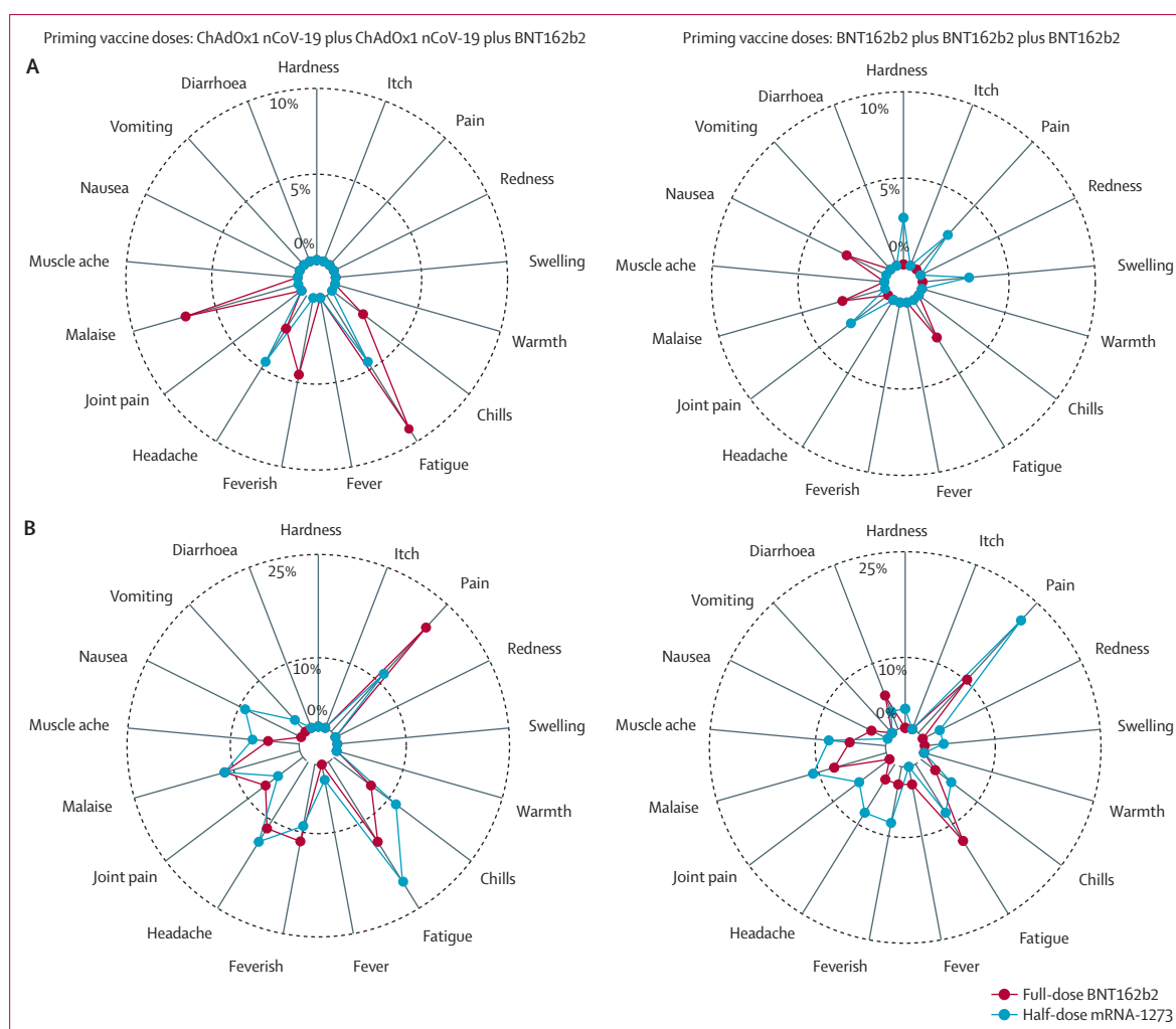
Figure 2: Solicited adverse events within 7 days following fourth-dose vaccination in participants who received a study vaccine (A) Severe (grade 3–4) local and systemic adverse events. (B) Moderate or severe (grade 2–4) local and systemic adverse events. For each solicited adverse event, the highest severity within the first 7 days after fourth-dose vaccination at an individual level was used to draw the plot.

four who did not attend the day 14 visit after the fourth dose. 133 people were included in the modified intention-to-treat immunogenicity analysis of the seronegative population, of whom 66 received full-dose BNT162b2 and 67 received half-dose mRNA-1273 (figure 1; table 2). Where the population does not total 133, there are missing data, the reason for which is still being investigated.