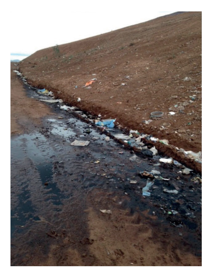
FIGURE 2: Leachate presence in an open dump site located in Mexico.

5 mm to 50 \mu m (due to size limitations). Within the type of plastics found, rubber and polymer-modified bitumen are included, whilst PE was the most dominant type of plastic. They reported that the kind of plastics detected might be from other sources, such as the different operations inside the facilities and atmospheric deposition (van Praagh and Liebmann, 2021). These examples of unexplored potential sources of MPs to the environment require a research focus on countries that rely on the disposal of plastic waste to landfills and further improvement of sampling techniques to detect lower sizes of MPs. Silva et al., (2021) calls for appropriate management and monitoring programmes alongside mitigation strategies, to control the pollution due to the leachate from landfills.