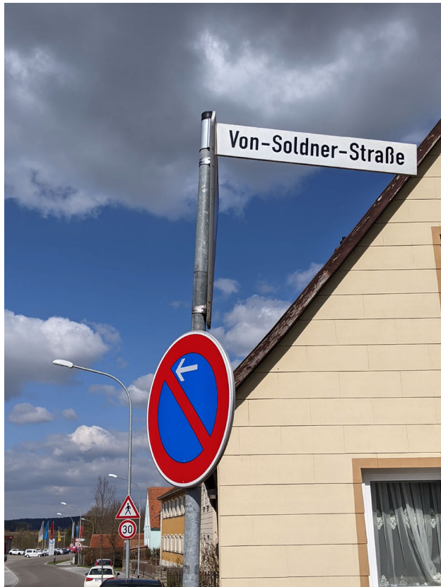
Figure 2. Von Soldner Street in Feuchtwangen. Approximate coordinates: 49^{\circ}10'17.8''\text{N} 10^{\circ}19'41.9''\text{E} .

look forward over a hundred years after Soldner's publication.