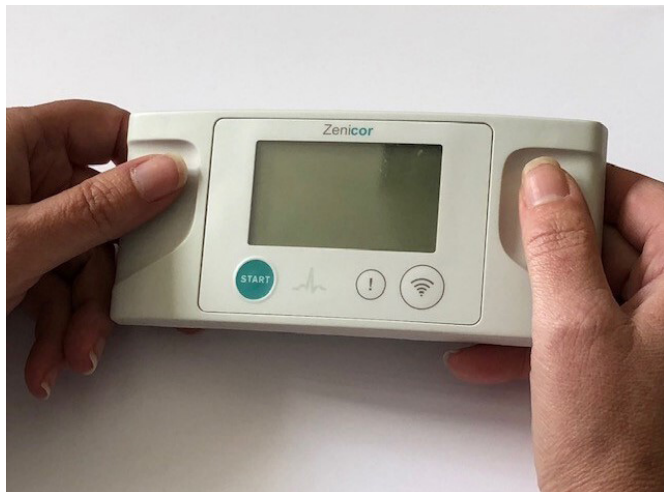
Figure 2 Zenicor hand-held ECG device used to screen for AF in the SAFER trial. AF, atrial fibrillation; SAFER, Screening for Atrial Fibrillation with ECG to Reduce stroke.

For results 1–3 (table 2), the practices will offer participants a consultation to discuss the result and its appropriate management. GPs are not provided with data on burden of AF, so this will not be considered. See figure 3 for a trial schematic. Practices are monitored to ensure that all patients who are found to have AF are reviewed by their GP.