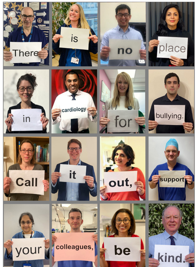
Figure 1 Promoting workplace culture and awareness through a British Cardiovascular Society anti-bullying campaign.

Evidence to suggest individuals may cynically attempt to manipulate such systems is limited. 4 While deliberately raising a false allegation is never acceptable, in the absence of additional evidence, those raising a concern must be treated from the outset as though the allegation is genuine and the department's standard policy for dealing with such reports should be followed.