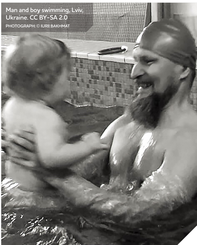
Man and boy swimming, Lviv, Ukraine.

In order to explore the Ukrainian context, three sectors were chosen for study because they are key for the EBRD's operations in terms of volume of investment and because of their (potential) direct and indirect impact on gender issues. These were: (1) agri-business, (2) municipal projects, and (3) the Women in Business programme. In all three cases, semi-structured interviews were undertaken with key informants from relevant areas.