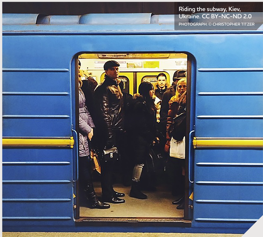
Riding the subway, Kiev, Ukraine. CC BY-NC-ND 2.0 PHOTOGRAPH: © CHRISTOPHER TITZER

While the prevalence of traditional attitudes towards gender roles has nullified some attempts at direct gender interventions, this study suggests that aspects of other interventions have had some positive indirect impacts on gender issues. As some respondents noted, tackling corruption can be seen as targeting a problem that undermines not only legal, economic and democratic objectives, but also gender equality. Corruption in multiple contexts has been identified as predominantly the abuse of power by men, with women more likely to suffer as a result of corrupt practices, thus exacerbating gender inequalities (Transparency International 2014). By supporting companies with a strong anti-corruption stance, institutions such as EBRD are helping to reverse