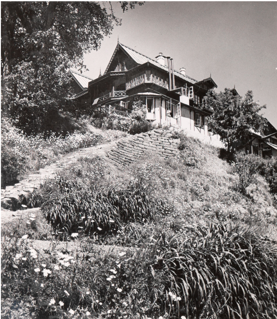
MS62/MB/2/N14/164 Black and white photograph of ‘The Retreat’ at Mashobra. This image and all descriptions reproduced by kind permission of the Special Collections Division, Hartley Library, University of Southampton.

Thanks must go to the anonymous writer of these descriptions for their work—for their adherence to the rules, conventions and procedures of cataloguing, and for their faithfulness to visual content. This piece can be considered a readymade. The poetic nature of the fusion between human and system is intensified as it is brought out of the archive, into a different space and for a different audience.