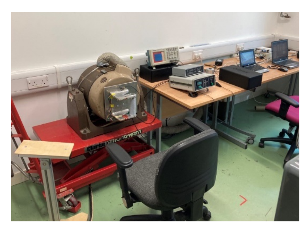
Figure 1. The experimental set-up.

Up to 12 healthy subjects with no prior vibration history participated in the study. Each subject went through all 16 exposure conditions, each containing a period of three minutes of holding the handle. Immediately after the exposure, the participants were instructed to release their hands from the handle and undergo the tests of the VPT, followed by an adequate recovery period (over 20 min). Different exposure situations were conducted in a randomized manner on four separate days for each subject.