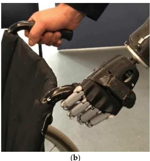
Figure 4. The Self Grasping Hand as fitted on participants (a) with glove; (b) without.

Participants were encouraged to use the SGH as much as possible for two weeks but were advised that they could interchange the SGH with their usual terminal device (body-powered split-hook or static cosmetic hand) if required to perform usual work or daily living activities.