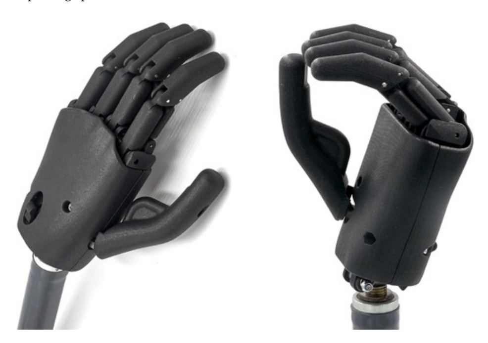
Figure 1. The Self Grasping Hand without cosmetic glove applied.

The "Self Grasping Hand" (SGH) was recently developed at Delft University of Technology, Netherlands, to address the aforementioned need for a better adjustable hand [6,7]. This adjustable passive hand was designed for adults with hand absence and can be mounted on the wrist connector of the user's existing socket. It is fabricated from a combination of 3D-printed components, laser-cut steel, and springs and is lightweight (<300 g). It requires no batteries, motors, or cables and operates using a linkage mechanism that mimics the natural tenodesis grasp/release pattern, i.e., the further the wrist extends, the more the fingers flex. To activate the grasping mechanism, the user achieves wrist extension by either pushing the palm against an object (such as a bicycle handle) or pushing an object into the palm. Grasp remains locked by a ratchet system until the user pushes the release button on the dorsal surface, then disengages the ratchet by pushing the wrist slightly into extension. The thumb is rigid but can be pivoted between radial abduction and opposition to the index finger (see Figure 1). It is designed to be worn with a skin colour-matched PVC or silicone commercially available size 71/4 " glove to improve grip and aesthetics [6,7].