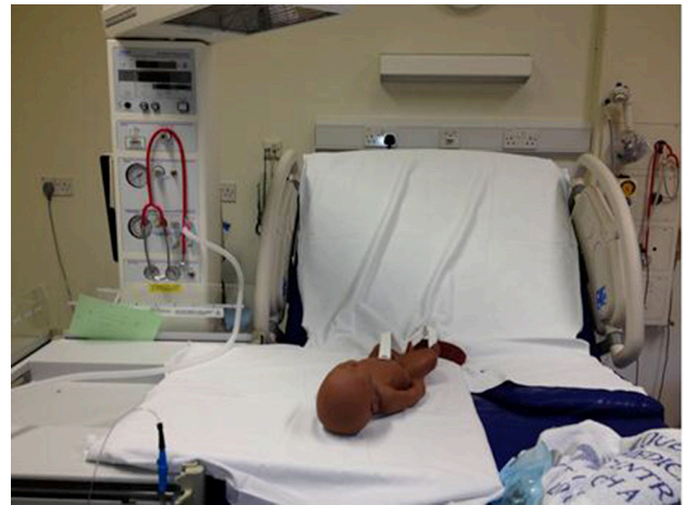
Figure 3 Demonstration of how to set up standard equipment for neonatal care beside the mother immediately after birth at vaginal births.