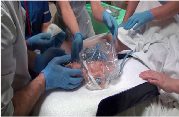
Figure 5 Demonstration of how to set up the LifeStart trolley for neonatal care beside the mother immediately after birth at vaginal births.