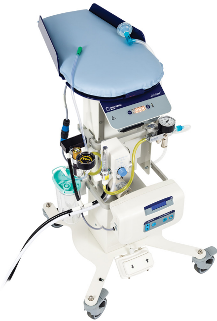
Figure 1 The LifeStart trolley.

standard equipment (the Draeger Resuscitaire and Fisher and Paykel CosyCot) and the LifeStart trolley. The set up required for each of these platforms is slightly different.