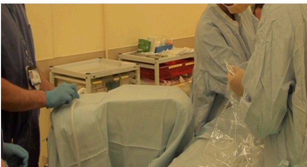
Figure 6 Demonstration of how to set up the LifeStart trolley for neonatal care beside the mother immediately after birth at caesarean section (note: the neonatal team should be scrubbed to maintain the sterility).

Prior to birth the midwife caring for the woman and the neonatal team need to discuss the potential management required for the individual baby and the best side of the bed to locate the platform or trolley.