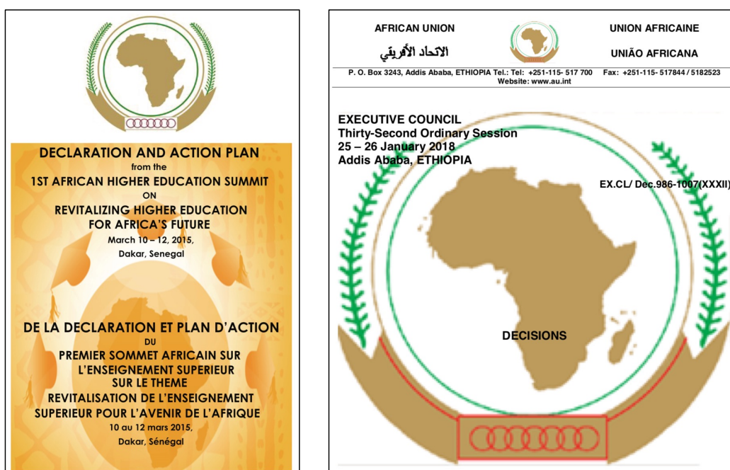
Fig. 3. left) The Declaration and Action Plan of the 1st African Higher Education Summit on Revitalizing Higher Education for Africa's Future (AUC, 2023) and right) the 2018 Executive Council of the AU recorded a Decision on the Reports of the Specialised Technical Committees (STCs) item C for the STC on Education, Science and Technology and then Article 21, which "CALLS UPON Member States to support the Pan-African Synchrotron Initiative" (AU-EC, 2023).

Education in Africa (ADEA), Association of African Universities (AAU), and African Development Bank (AfDB). An outcome of the latter meeting was a Declaration and Action Plan (Figure 3) to bring about a shared Strategic Framework for inclusive growth and sustainable development, and a global strategy to optimize the use of Africa's resources for the benefit of all Africans. Article 5.3.3 on page 22 recommends establishing a synchrotron as a centralized African scientific facility.