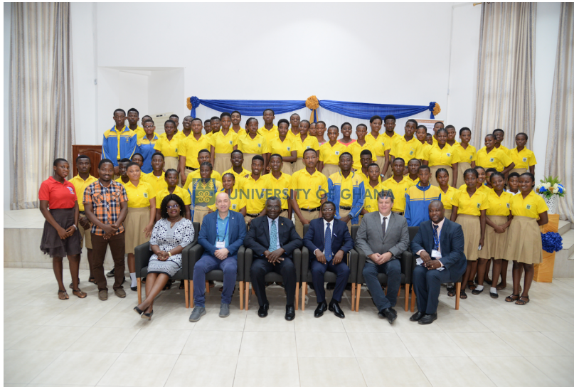
Fig. 4. Meeting between AfLS, PCCr and the Ghanaian Science Ministry during the joint AfLS-PCCr Conference in Jan 2019.

EC, 2023). The AAS formed the Africa Synchrotron Initiative (AAS-ASI) in 2019, which began meeting as a 1-2 year think tank in 2022 (Khalil, S et al, 2022; AAS, 2022). In January 2019, AfLS Conference was held in Accra, Ghana. There were positive interactions with the Ghanaian Science Ministry (see figure 4) and a commitment from the President of Ghana, HE Nana Akufo-Addo, to be a champion of the African light source project, not only in his own government, but also in the Economic Community of West African States and the African Union (Ghana Business News, 2019).